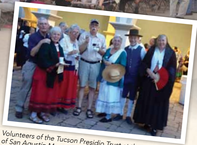
Volunteers of the Tucson Presidio Trust at the Fiesta of San Agustín Mass.