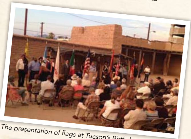
The presentation of flags at Tucson's Birthday event.