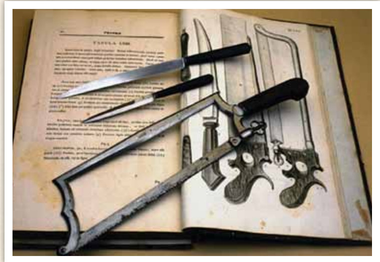
The three instruments illustrated are from an 18th century surgical instrument set and include two amputation instruments, in a leather case. Also shown is a copy of Brambilla's textbook of military surgery from 1782.

The Tohono O'odham classification of diseases, probably from ancient times, differentiated between staying sickness and wandering sickness. Staying sickness was unique to the person (and would include things such as diabetes, heart disease, cancers), whereas wandering sickness could 'wander' from person to person (tuberculosis, measles, smallpox and other