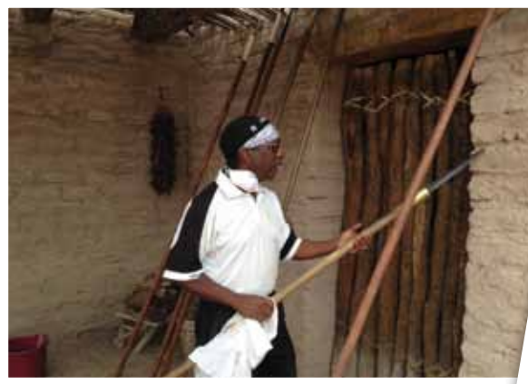
Volunteers worked hard to spruce up the exhibits and grounds at our recent clean-up day.

Docent training was a great success. Some participants were volunteers with Living History and Friday-at-the-Fort and wanted to brush up on their knowledge, some were continuing docents and some were brand new to the class. We welcome our newest docents and volunteers to the team!