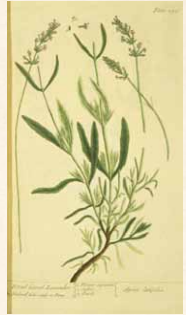
Broad leaved lavender ( Spica Latifolia ), 1737 from A Curious Herbal . Scottish illustrator and author Elizabeth Blackwell published A Curious Herbal , noted for its beautiful illustrations, in weekly installments between 1737 and 1739. Lavender water was one of many common herbal home remedies.

This is the background for the rich history of medicine at the Presidio, and some of what will be on display at the new exhibit.