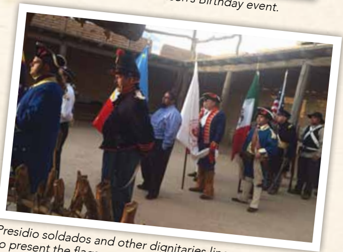
Presidio soldados and other dignitaries line up in to present the flags.

On August 20th, the Presidio opened its gates to the Tucson-Pima County Historical Commission as they hosted Tucson's 240th birthday celebration. Event partners included Pima County, the City of Tucson, the City of Tucson Clerk's Office, the Tucson Presidio Trust, Los Descendientes del Presidio del Tucson, Pioneers of the Old Pueblo, and El Presidio Neighborhood Association.